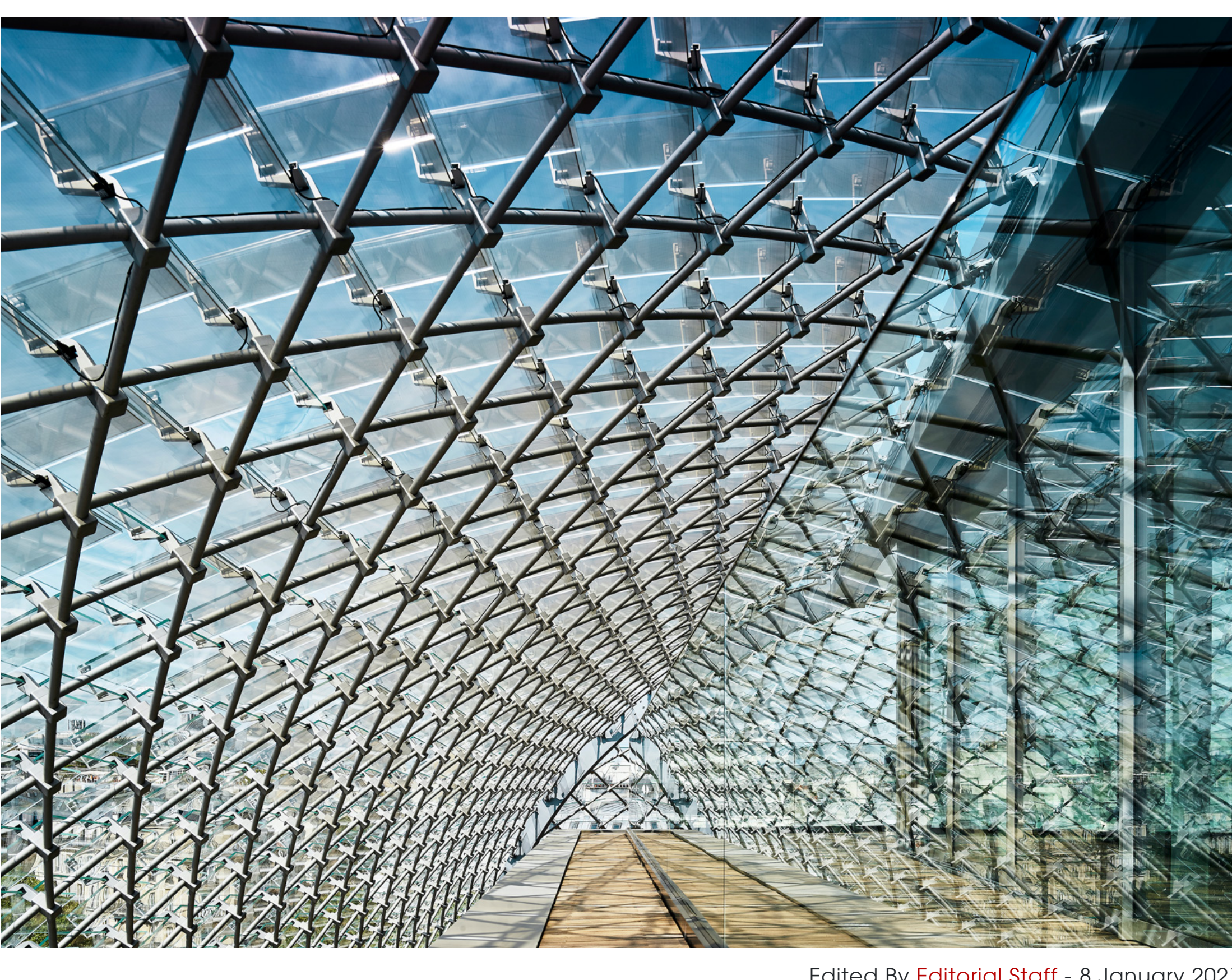
Edited By Editorial Staff - 8 January 2021