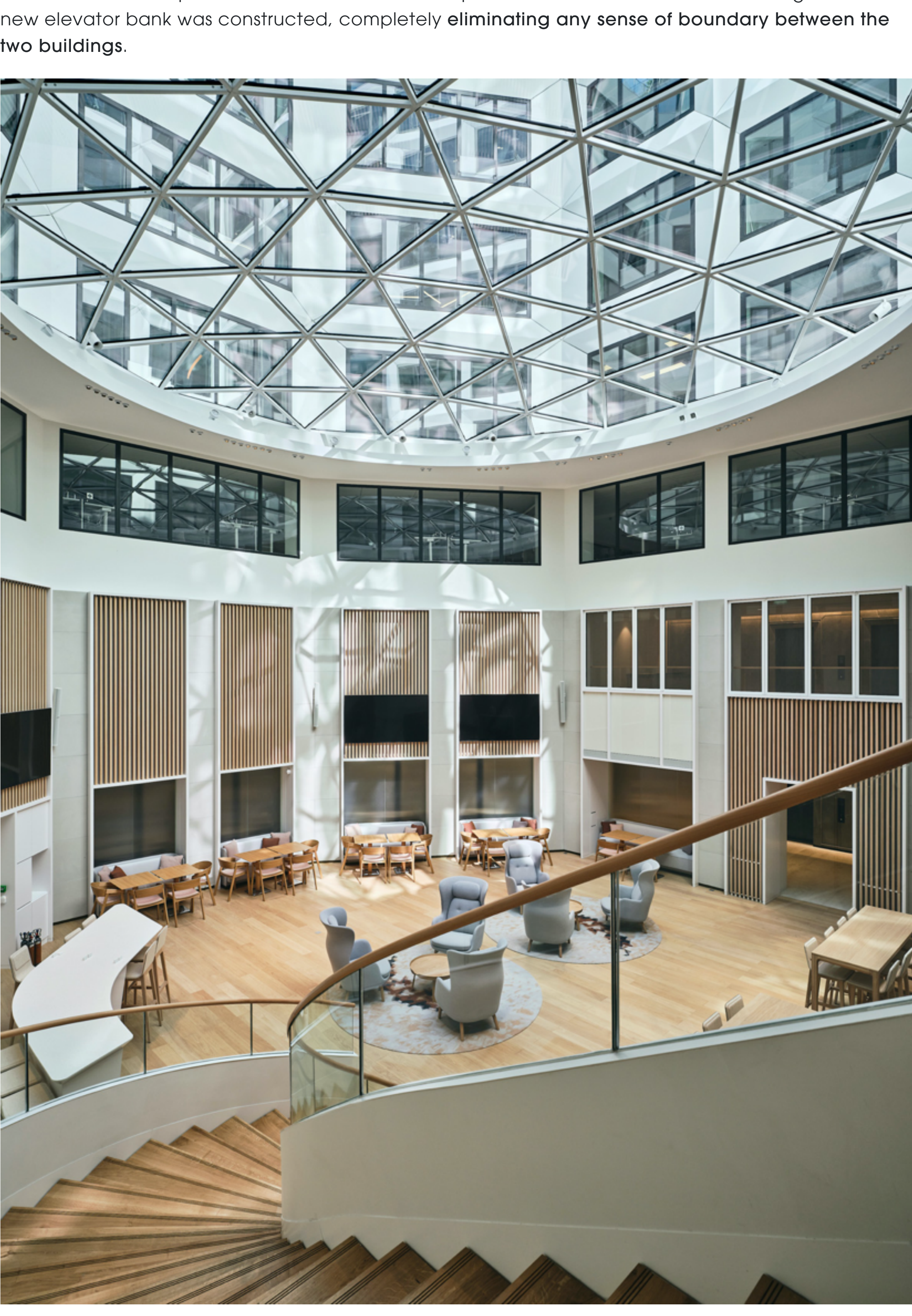
The large common areas, designed by PCA-STREAM, include a triple-height atrium, which acts as a town square for staff, and a panoramic terrace with ornamental greenery.

Following the restructuring project conceived by architects PCA-STREAM, however, the complex has acquired an urban readability on par with its extraordinary location. Aiming to address the challenges of the workspaces of tomorrow, RF Studio redesigned the complex's interior architecture to create flexible, open, well-lit, and comfortable spaces. Circulation areas were reimagined and a new elevator bank was constructed, completely eliminating any sense of boundary between the two buildings.